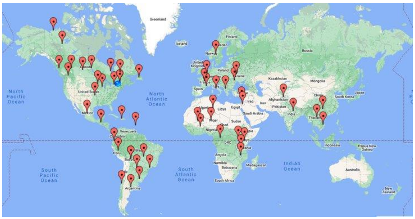
The Food SINERGY network benefits from a diversity of knowledge from its members' collective experience working in localities around the world, depicted in the map above.

In March 2023, over 30 international delegates gathered at a forum in Mont Orford, Québec to launch the Food Systems Innovation to Nurture Equity and Resilience Globally (Food SINERGY) collaboration network. Food SINERGY convenes scholars and practitioners from universities, NGOs, Indigenous networks, farmers' associations, consumer organisations, research institutes and social enterprises with a shared interest in transforming food systems in favour of greater resilience and equity. In the weeks preceding the Food SINERGY Forum, two online pre-forum sessions and a consultation survey integrated the participation of additional members of the Food SINERGY collaboration network and provided preliminary insights to orient the forum dialogue.