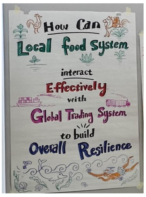
The question posed in this poster guided paired discussion walks in the forest.

Resilience: The concept of "resilient food systems" was clarified to reach a shared understanding that creating resilient food systems is a transformative process, acknowledging that the current food system is not resilient and should therefore not be sustained. Food system resilience depends on diversified strategies that build stable redundancies and stopgaps into the food system, such that if one strategy fails, others can quickly and effectively fill the gap before negative consequences occur to planetary and human health and well-being. For food systems to be resilient, they must also be equitable.